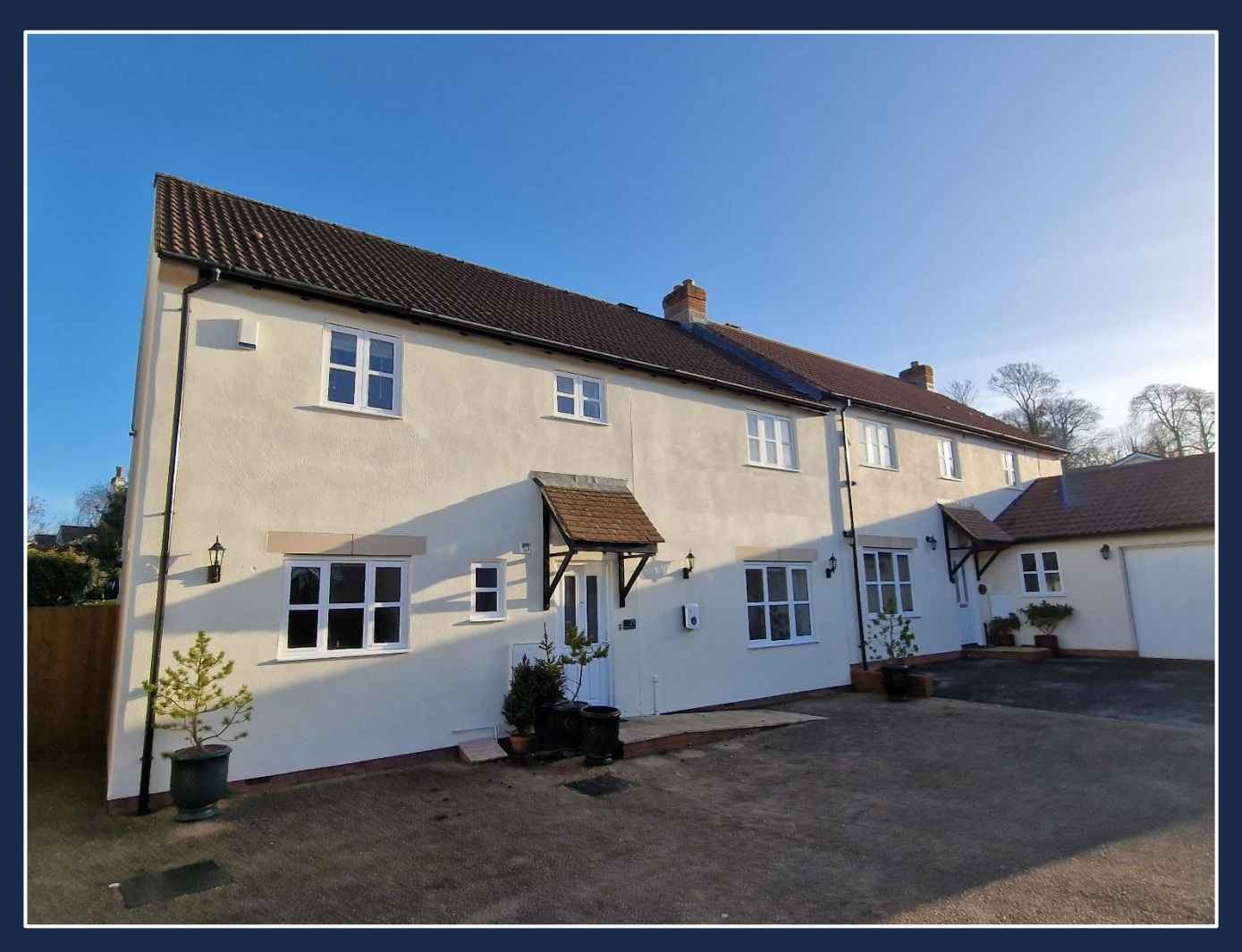
71 Uphill Road South, Uphill Village, Weston-super-Mare, North Somerset, BS23 4TU